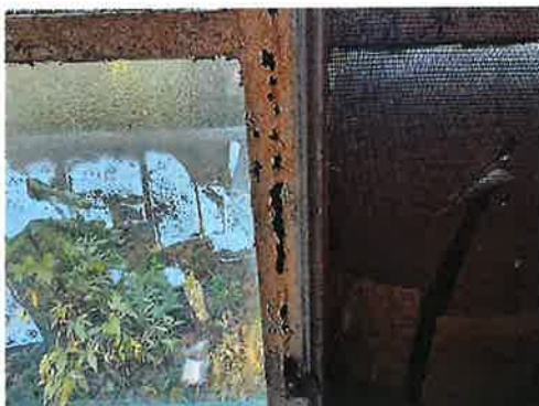
Bedroom B(013) D-Wall, Left Metal Window Sash Lead-Positive, Deteriorated