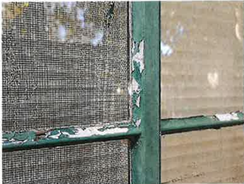
Exterior(015) A-Wall, Right Metal Window Sash Lead-Positive, Deteriorated