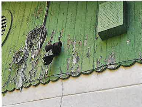
Exterior(015) D-Wall, Left Upper Wood Wall Lead-Positive, Deteriorated