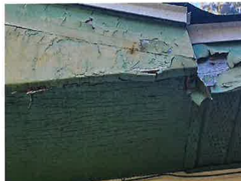
Exterior(015) D-Wall, Left Wood Fascia Lead-Positive, Deteriorated