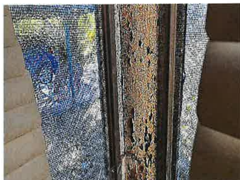
Bedroom C(014) B-Wall, Right Metal Window Casing Lead-Positive, Deteriorated