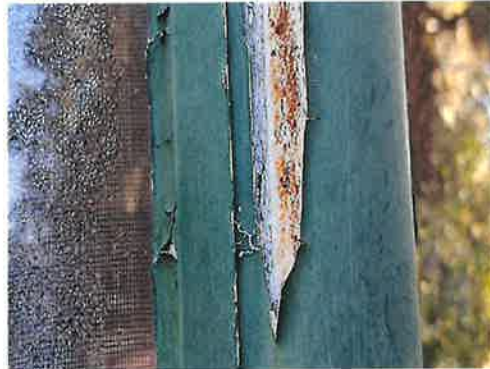
Exterior(015) D-Wall, Right Metal Window Sash, Casing Lead-Positive, Deteriorated