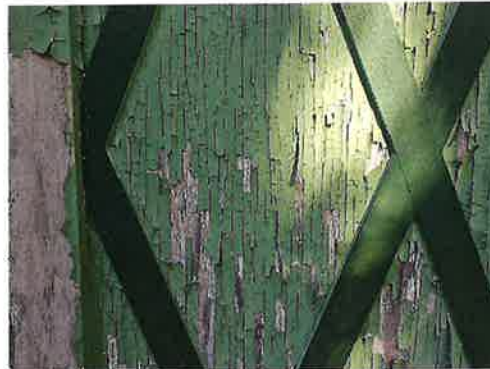
Exterior(015) C-Wall, Right Wood Garage Door Lead-Positive, Deteriorated