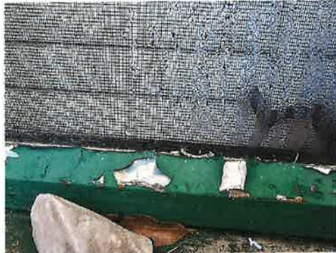
Exterior(015) C-Wall, Center Metal Window Casing Lead-Positive, Deteriorated