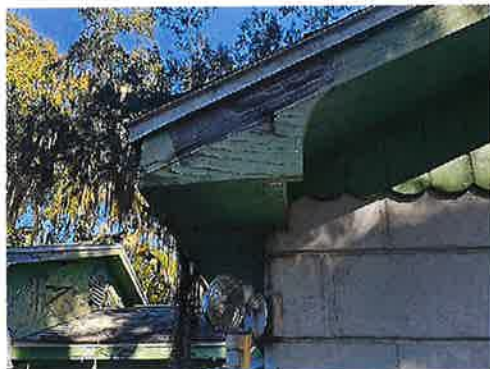
Exterior(015) C-Wall, Center Wood Fascia Lead-Positive, Deteriorated