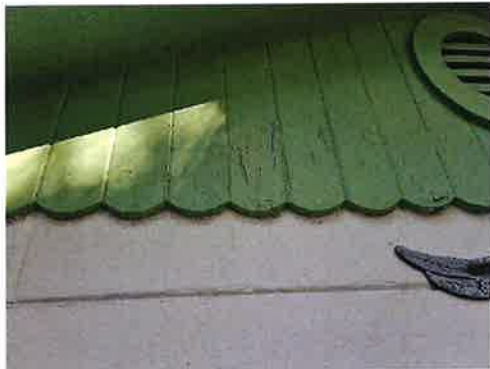
Exterior(015) C-Wall, Right Upper Wood Wall Lead-Positive, Deteriorated